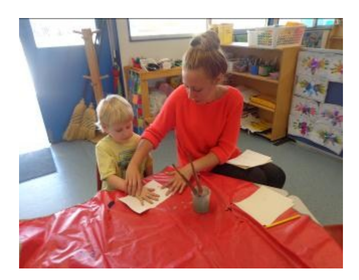
We enjoyed making elephants with our hand prints!!