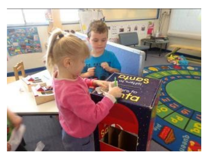
We enjoyed posting letters to 'Santa' in our home corner 'Post Office'