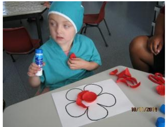
We celebrated Remembrance Day by making poppies with cup cake papers.