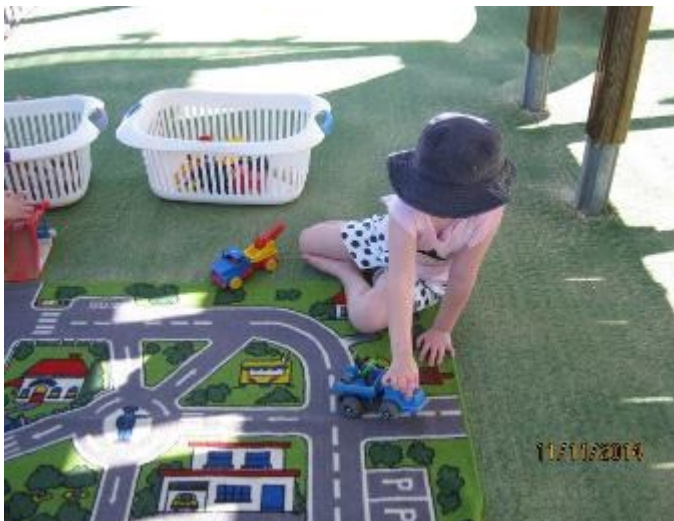
Quiet time on the mat outside with cars and trucks was very popular.