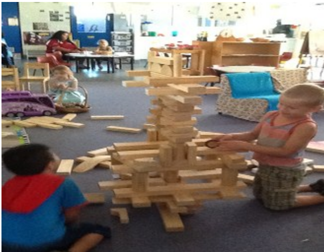
Billy is helping Alex to build a massive tower.