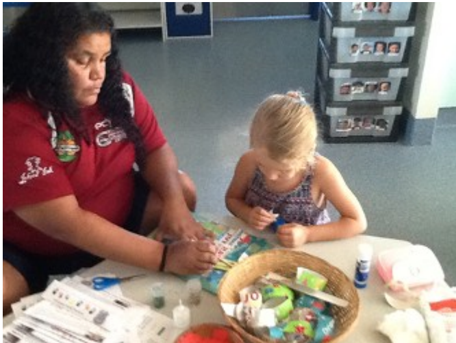
Christmas trees with wrapping paper was a challenging sorting experience.