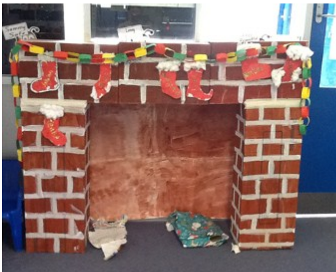
Our fireplace is looking good with some stocking hanging around it. I wonder if Santa will come?