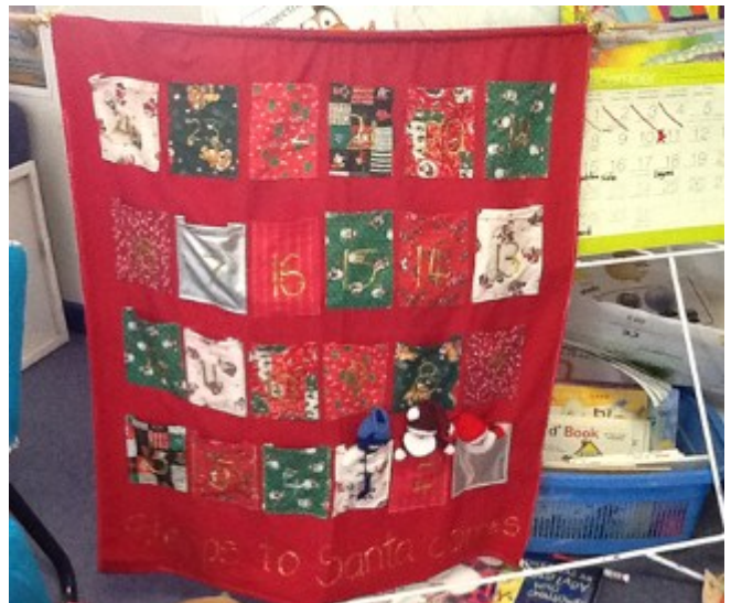
We are getting very excited about the number of Preschool Sleeps to Christmas getting lower.