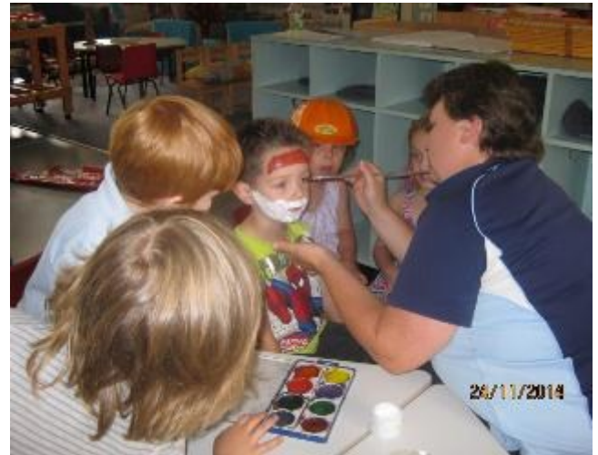
Face painting has been very popular with lots of Santa's and Toothless the dragon.