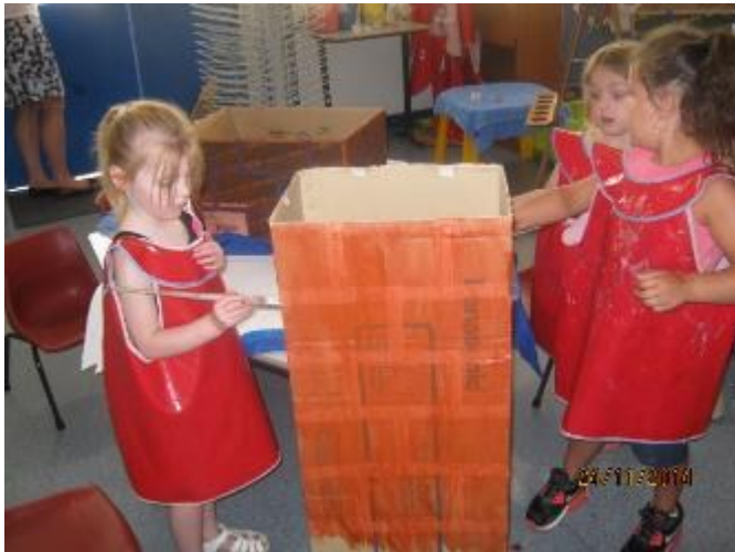
We are creating a fireplace as a centrepiece for our Christmas festivities, maybe Rosetta will visit.