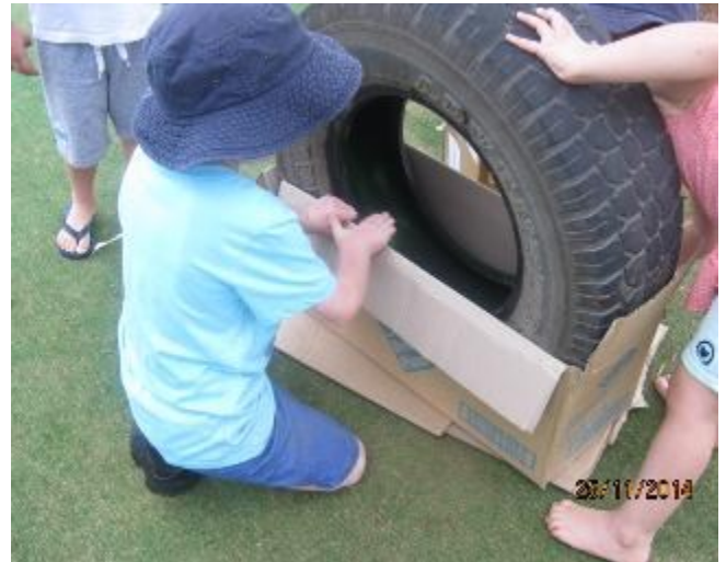
Thanks Tyre Right for the tyres they have been very useful in our outside play.