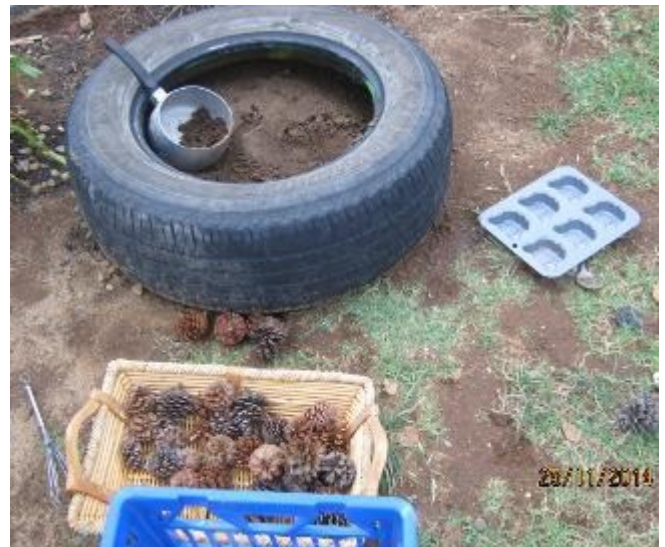
Mud pies in the new digging pit. Would you be tempted to taste one?