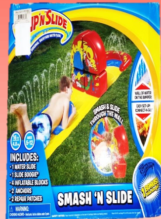
3rd Prize Slip & Slide and Ball