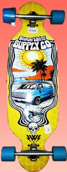
1st Prize Skateboard