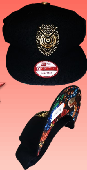
2nd Prize Indigenous All Stars Cap