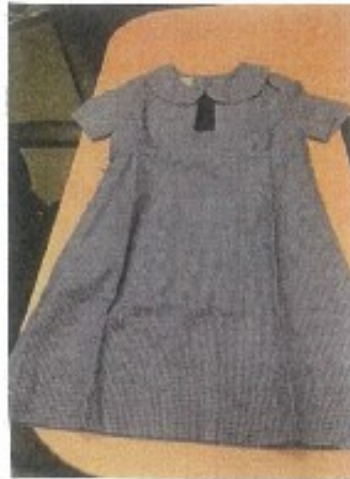
Summer Dress $20