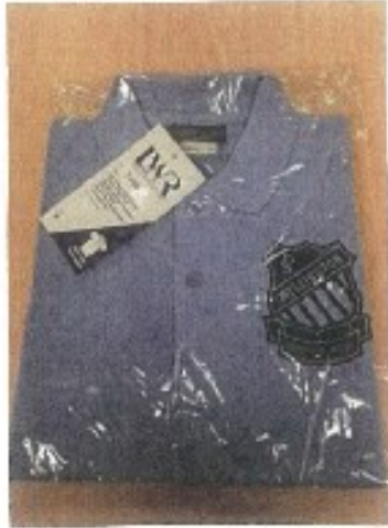
Polar Shirt $10