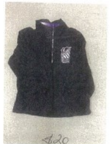
$20 Polar Fleece Jumper