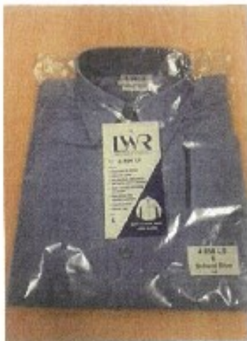
longs.button Shirt $10