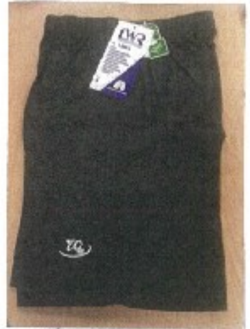
Navy Shorts $10