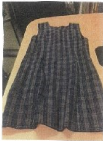
Winter Dress $20.