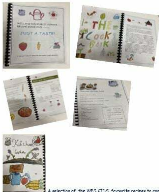
A selection of, the WPS KIDS, favourite recipes to cook!